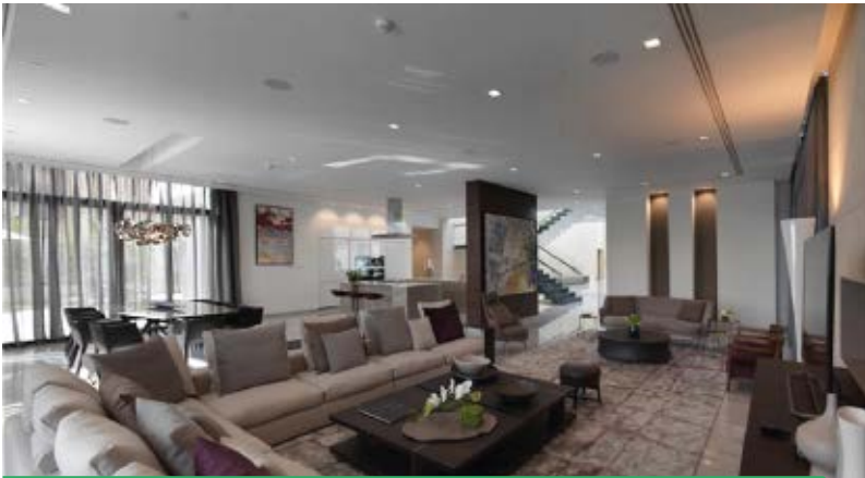
Project: Private villa at Mohammed Bin Rashid City – District One Scope of work: Home Automation Brand: Daikin & Honeywell Type of Machines: VRF System, Home automation system