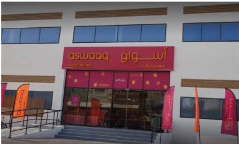
Project: Aswaaq supermarket, Garhoud, Dubai Scope of work: Retrofit Brand: York Type of Machines: DX Ducted split units COOLCOMFORT