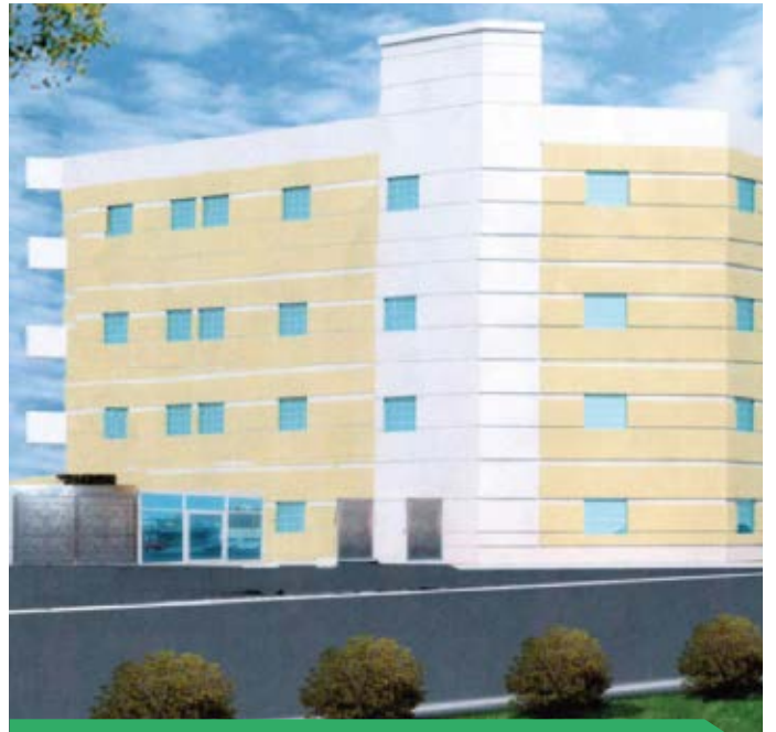
Project: Labor camp at Sonapur, Dubai Scope of work: Supply & Installation Brand: Blue Star Type of Machines: Wall mounted split units COOLCOMFORT