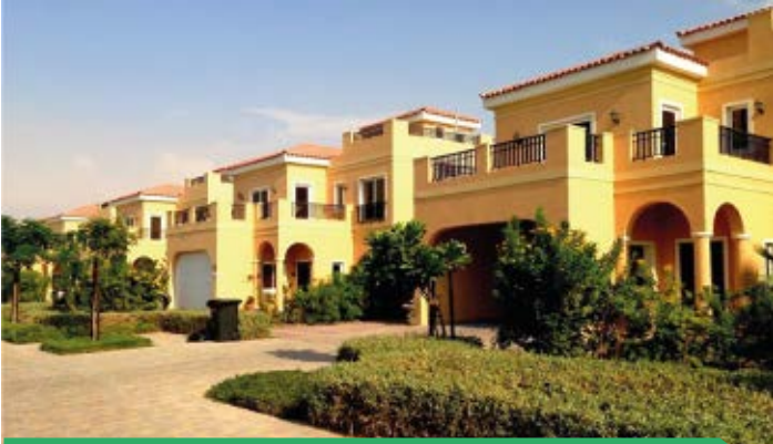
Project: Private villas at The Villa, Dubai Scope of work: Annual Maintenance Contract Brand: Trane Type of Machines: VRF system