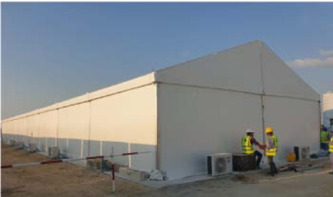
Project: Site office & Labors' resting area at Project Falcon, Abu Dhabi Scope of work: Installation (66 nos) Brand: Blue Star Type of Machines: Wall mounted split units