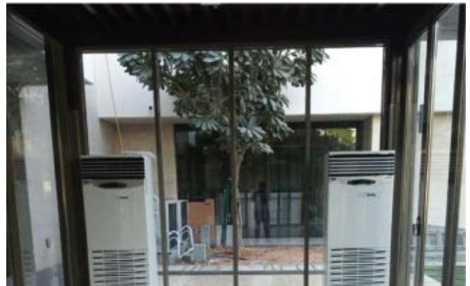
Project: Private villa at Al Khawaneej, Dubai Scope of work: Supply & Installation Brand: Carrier Type of Machines: Floor standing units