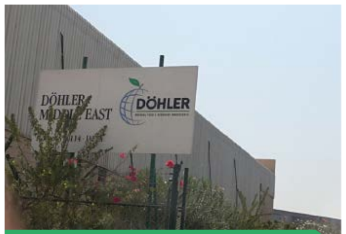
Project : Product Facility for a MNC. Scope of work: Annual maintenance contract Brand: Rheem Type of Machines: FAHU + CU