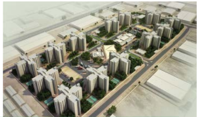
Project: G+10 JAFZA staff accommodation bldg, Jebel Ali, Dubai Scope of work: Installation Brand: Daikin Type of Machines: VRF system