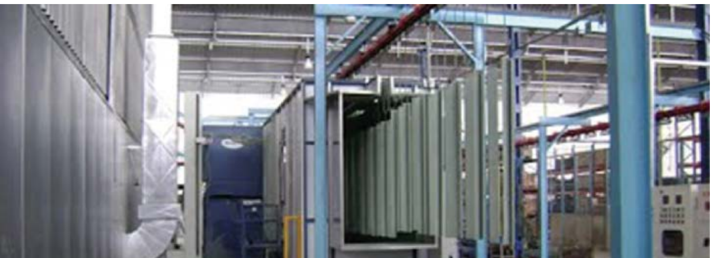
Project: Procoat warehouse, Jebel Ali, Dubai Scope of work: Supply & installation Brand: Rheem Type of Machines: Package units & DX Ducted split units