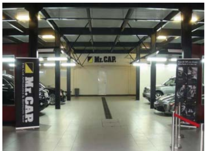
Project: Mr. Cap warehouse at Al Quoz, Dubai Scope of work: Supply & Installation Brand: SKM & Blue Star Type of Machines: DX Ducted split units & wall mounted split units