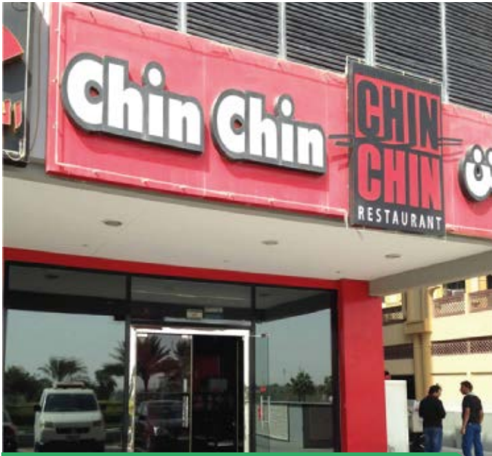
Project: Chin Chin Restaurant, Al Barsha, Dubai Scope of work: Supply & Installation Brand: Midea Type of Machines: Floor standing units COOLCOMFORT