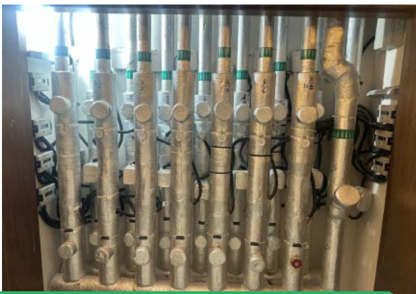
Project: AL LIWAN BUILDING 3