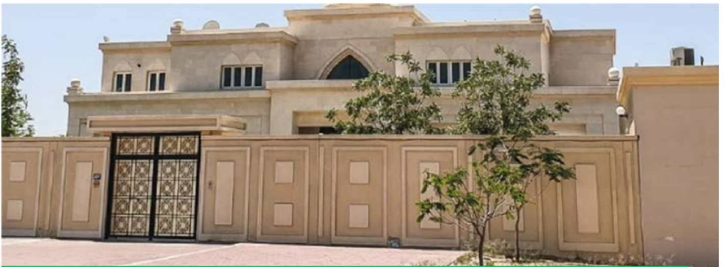
Project: Private villa at Al Khawaneej, Dubai Scope of work: Annual Maintenance Contract Brand: Samsung Type of Machines: DX Ducted split & Wall mounted split units