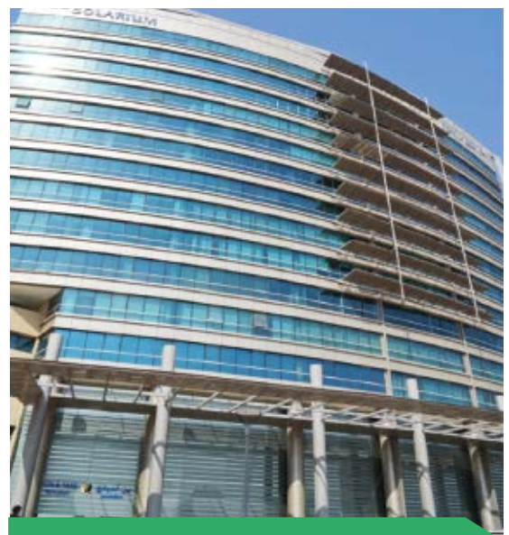
Project: Commercial Offices Scope of work: Preventive Maintenance Services Brand: Mekar Type of Machines: Chilled Water Fan Coil Units