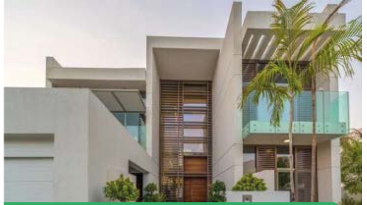
Project: Dohler Middle East factory, Jebel Ali, Dubai Project: Private villa at Mohammed Bin Rashid City – District One Scope of work: Revamp & Preventive Maintenance Service Brand: Daikin Type of Machines: VRF System, Home automation system